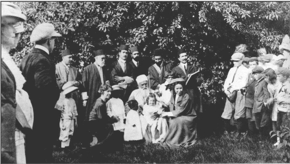
Abdu’l-Bahá at the MacNutt home in Brooklyn, NY